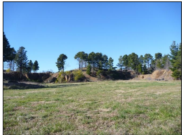
Figure 3.2 CB&E at brickworks showing excavated areas