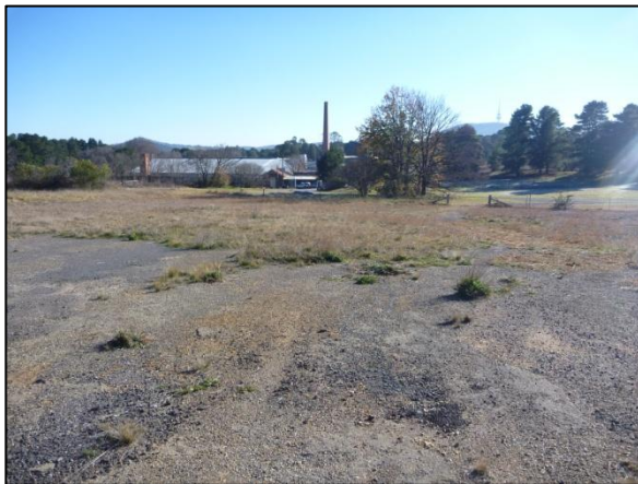
Figure 3.1 CB&E looking north west with tarmac in foreground

The area has been impacted by the construction of roads, the Canberra Brickworks including large areas of excavation to the east, laying of gravel and tarmac, weed infestation and pine plantation and general mechanical disturbance over a majority of the project area.