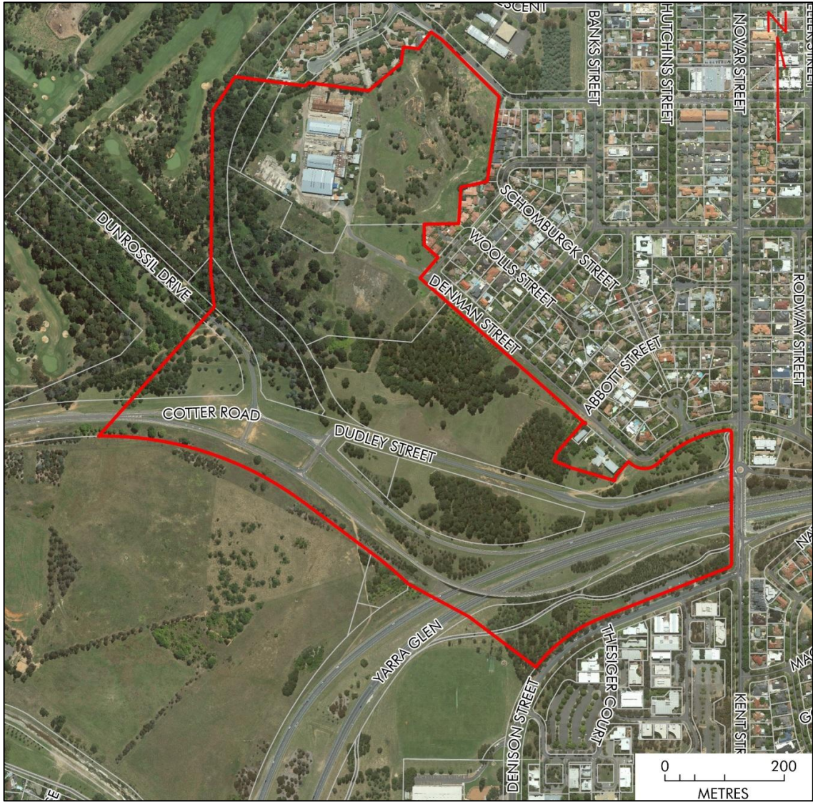
Figure 1.1 Canberra Brickworks and Environs project area