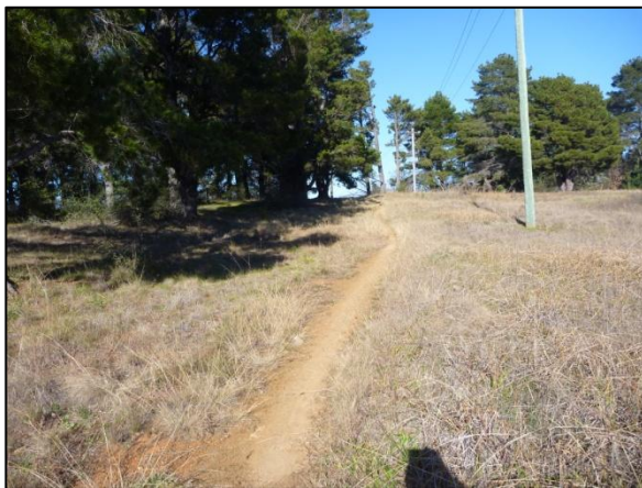
Figure 3.3 CB&E looking west along pedestrian track