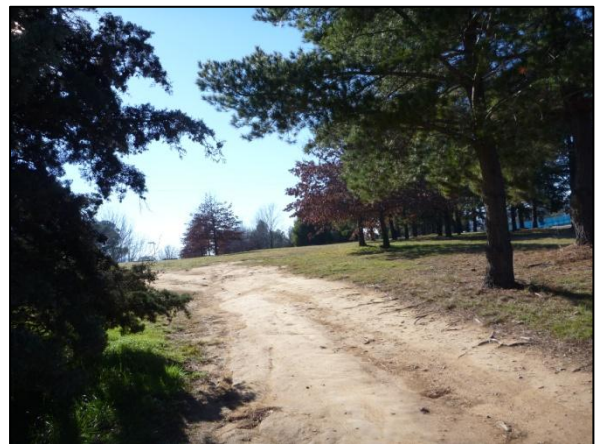
Figure 3.4 CB&E looking west along vehicle track