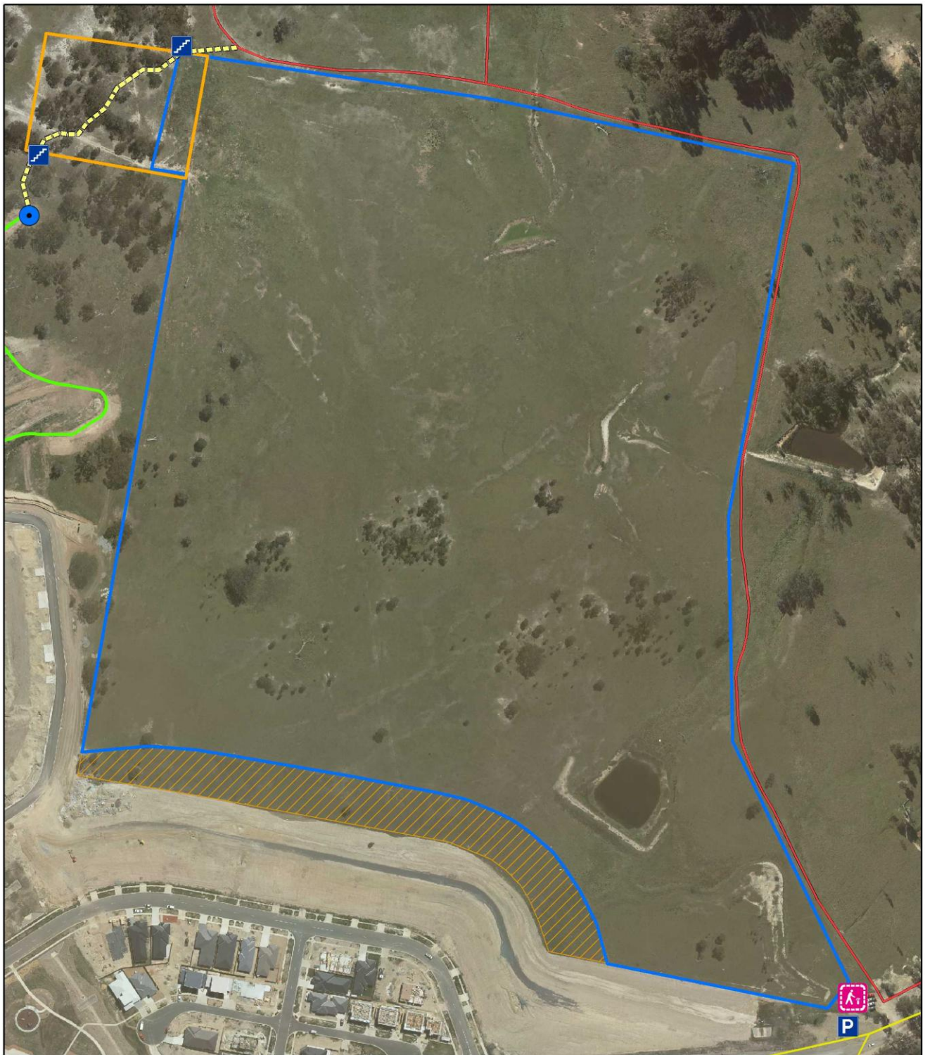
Figure 2. Bonner 4 East Offset Site