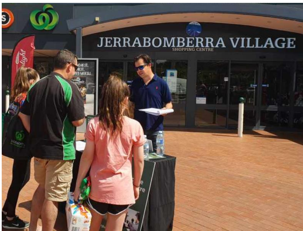
Figure 2. Taking community feedback in Jerrabomberra.