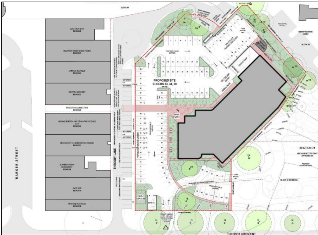
Figure 2 – Location and indicative site plan – Inner South Health Centre