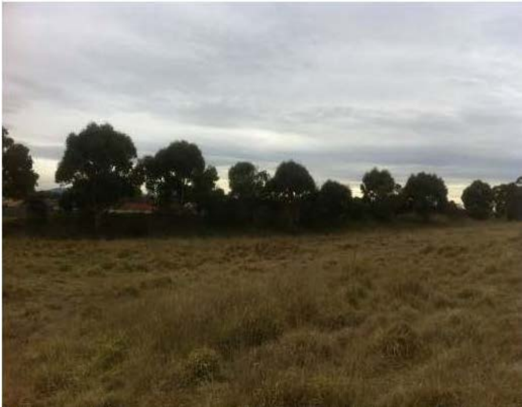
Photo 4: Soil mound with trees proving a visual barrier to residents to the north of the site